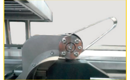
Pre-cut option of bag excess cut.